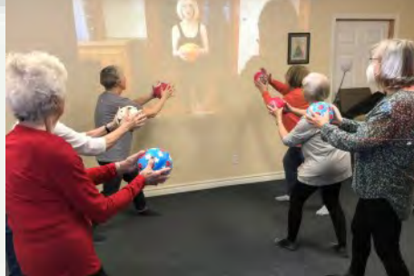
Participating in Fitness for Your Aging Brain as a group adds a social element to this popular program supporting seniors' mental and physical fitness.

Both program attendance and the number of programs offered increased in 2023. Most adult programs are offered in partnership with individuals or other groups and agencies, such as the Merrickville & District Community Health Centre and the ZenMindset Ladies Club. The Library also hosts one book club and provides books for several others in the community.