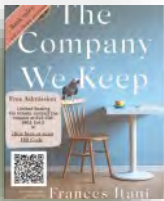
The "Library Readers" book club co-hosted a visit by Canadian author Frances Itani in 2023.

The Library is committed to providing opportunities for both adults and children and is always happy to work with local groups or individuals to offer a broad selection of programs to the community. New programs are planned for seniors and kids in 2024.