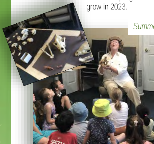
Summer Science Fun

Thank You to the Friends of the Library for sponsoring our children's programs