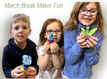
March Break Maker Fun